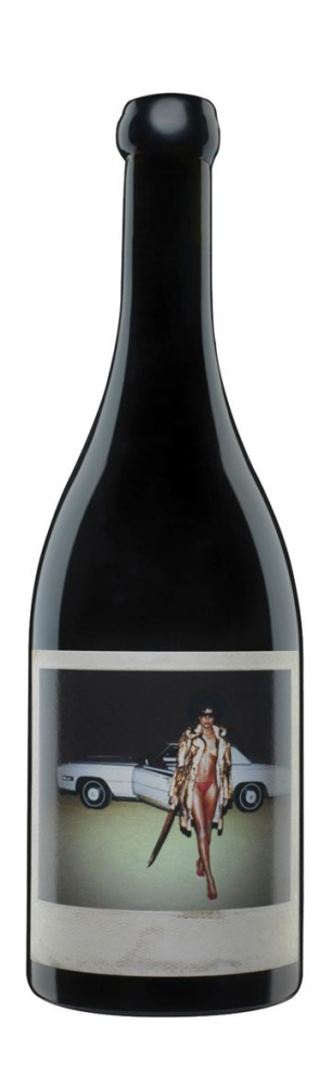
Alcohol :15,20 % Composition: 45% Syrah, 40% Petite Syrah, 5% Grenache, 5% Malbec